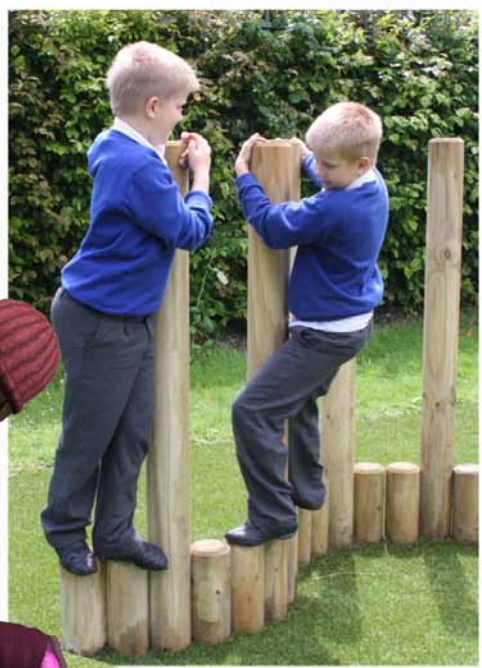
Log Walk Weaver