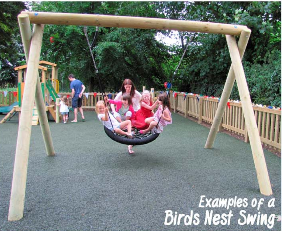
Examples of a Birds Nest Swing