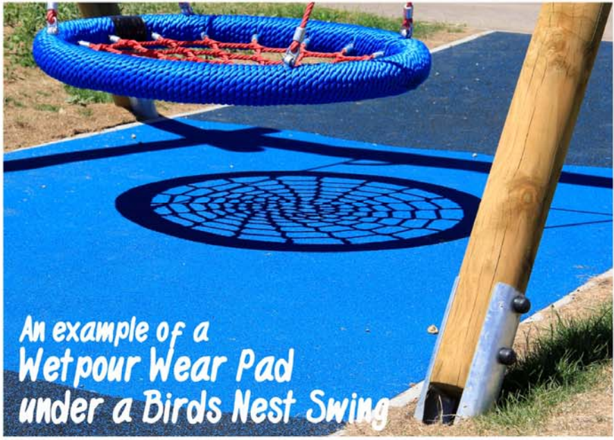
An example of a Wetpour Wear Pad under a Birds Nest Swing