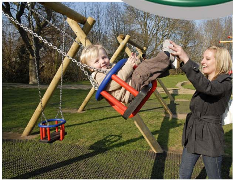
An example of a Cradle Swing