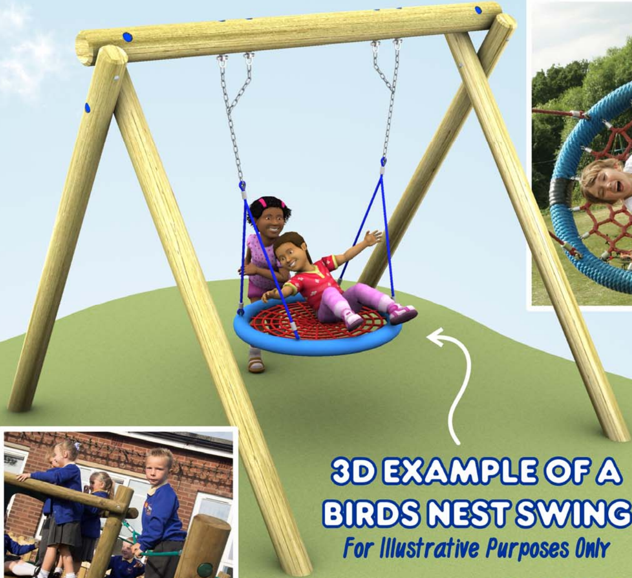
3D EXAMPLE OF A BIRDS NEST SWING For Illustrative Purposes Only