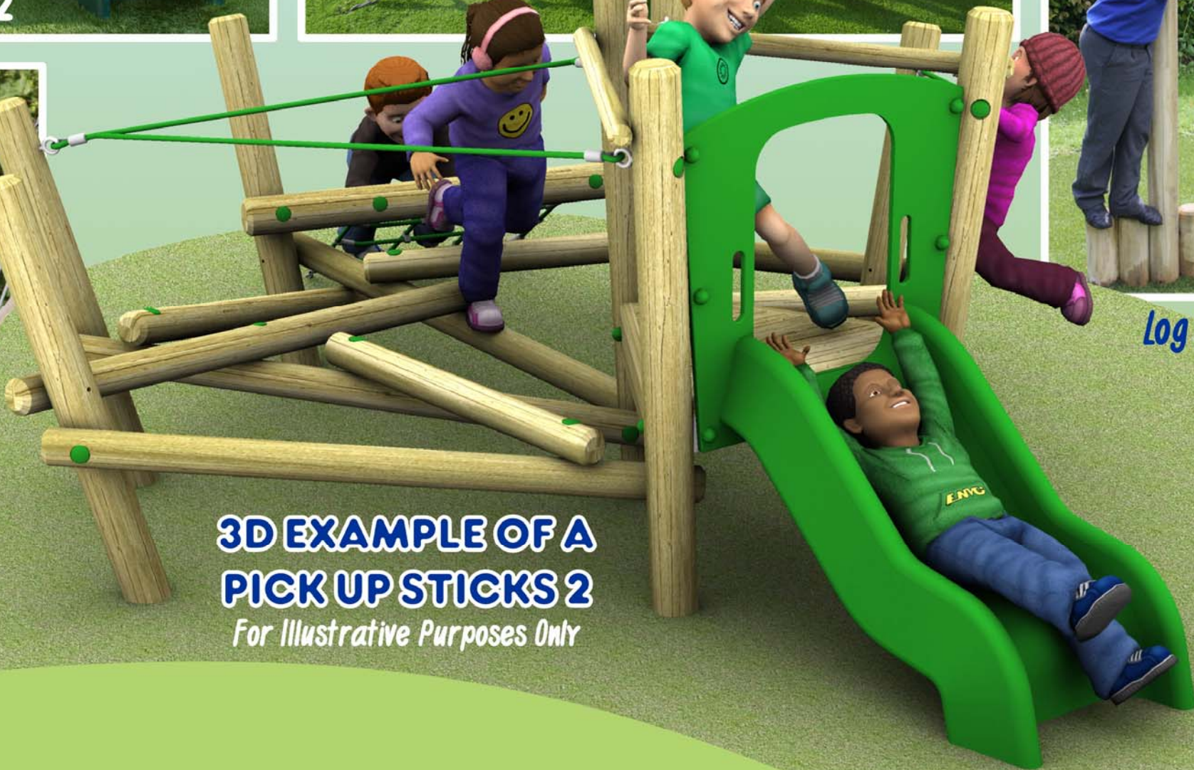
3D EXAMPLE OF A PICK UP STICKS 2 For Illustrative Purposes Only