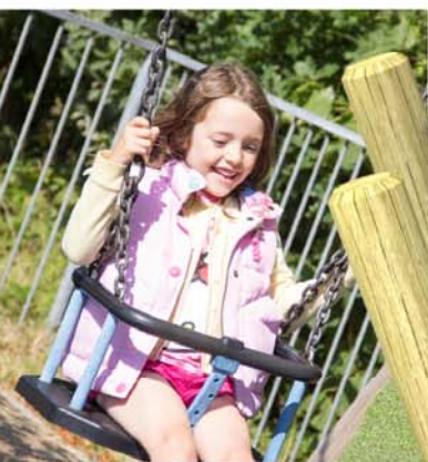
An example of a Cradle Swing