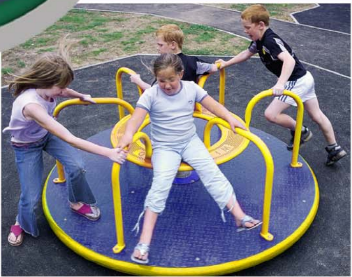
An example of a Spiro-Whirl

Drawing No: NMQ3918_A Drawn By: DO 4 Scale: 1:200 @ A2 Date: 18-04-17 Page: 1 of 1