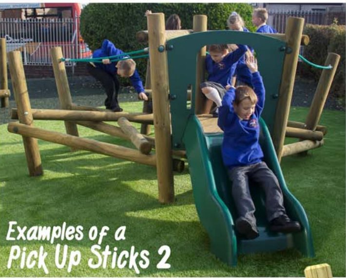
Examples of a Pick Up Sticks 2